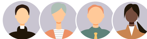
School Chaplain Business Managers Admin Teams Finance Teams

Future Growth: An overwhelming 93% of employers state that degree apprenticeships play a pivotal role in fostering the future growth of their organisations. (QAA Degree Apprenticeship: Voices from the frontline Impact, Policy and Good Practice Guide 2024)