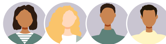
Teachers Teaching Assistants Pastoral Teams Safeguarding Leads

Apprenticeships can be used as part of a People and Talent or Workforce Strategy and also for Continued Professional Development (CPD). Schools, Colleges and MATs employ lots of different roles and numerous apprenticeships are available for training or upskilling staff. Various apprenticeship training programmes may be relevant to your school and your workforce development with opportunities for both teaching staff and support staff.